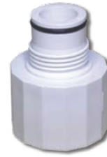
1 1/4" Female ACME x 1" Male ACME Adapter

Allows you to upgrade existing Rain Bird® Eagle 700 1 1/4" ACME sprinklers to any Toro 800S or DT Series Sprinkler. P/N TA36-132.